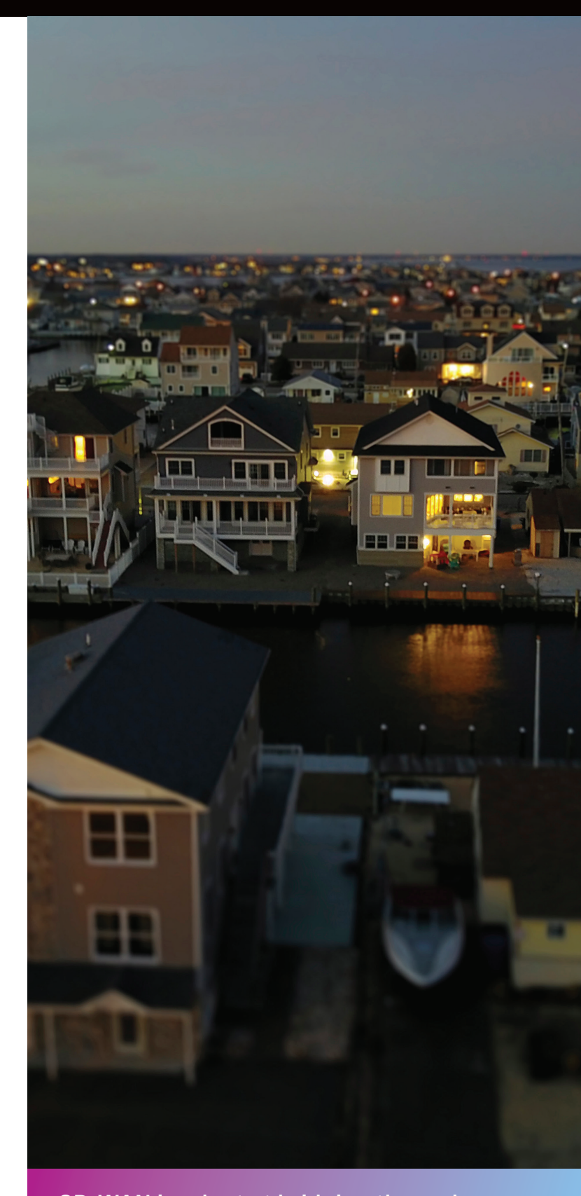
SD-WAN is adept at bridging the real estate industry's technological gaps without overspending on premium network connections.

The right SD-WAN tool could allow this business to move into the future without sacrificing quality. Even if satellite internet is the best this company can get, the technology allows for great QoS and high availability.